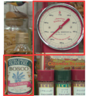
ROI mode (After cropped)