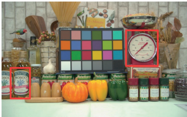
ROI mode (Cropping areas)

Condition: 2000 lx F5.6 (UXGA image ADC 12 bit mode, 60 frame/s, internal gain 0 dB)