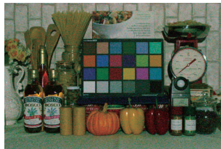
1 lx LLP mode internal gain 51 dB, F1.4