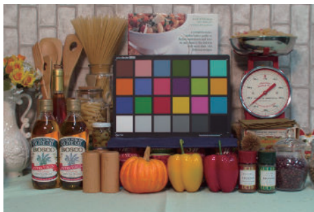
1000 lx HLP mode internal gain 12 dB, F5.6

(recommended recording approx. 5.04M pixels, 4:3, ADC 12 bit mode, 59.94 frame/s)