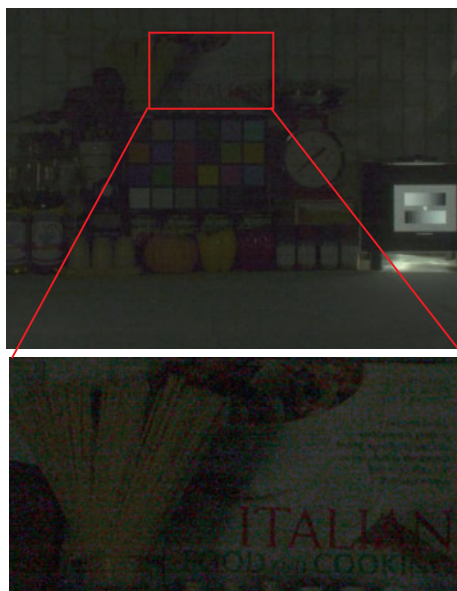
A/D conversion 14 bit mode