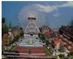
5M 5:4 recommended recording 2560H × 2048V