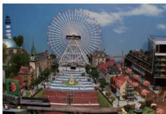
All-pixel scan recommended recording 3072H × 2048V

Number of recommended recording pixels: All-pixel scan approx. 6.29M pixels (3:2), approx. 5.04M pixels (4:3), approx. 5.24M pixels (5:4), and approx. 5.31M pixels (16:9).