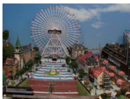
5M 4:3 recommended recording 2592H × 1944V