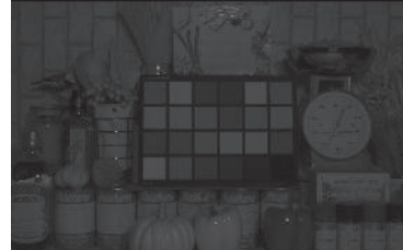
Existing product (5.86 μm)