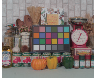
IMX264LQR (3.45 μm)

Condition: 2000 lx F = 5.6 (ADC 12 bit mode, Exposure time 1/60sec, internal gain 0 dB)