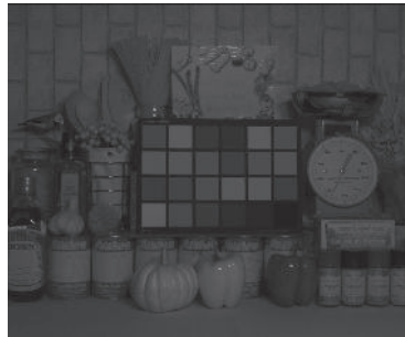
IMX264LLR (3.45 μm)

Condition: LED lighting of 850 nm wavelength F = 4.0 (ADC 12 bit mode, Exposure time 1/60sec, internal gain 0 dB)