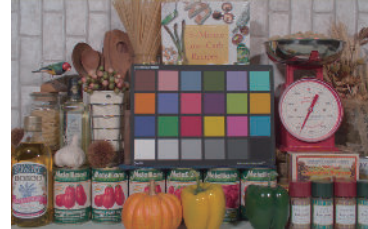
Existing product (5.86 μm)