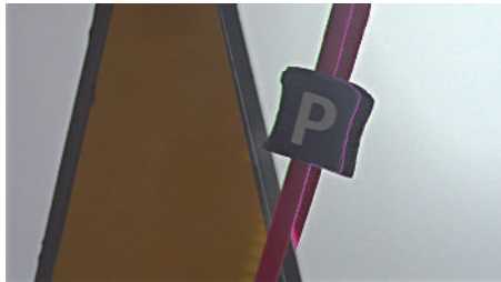
Multiple exposure HDR

Condition: Exposure time (3.2 ms/0.2 ms) blended image