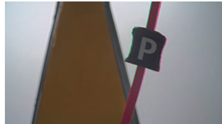
Quad Bayer Coding HDR