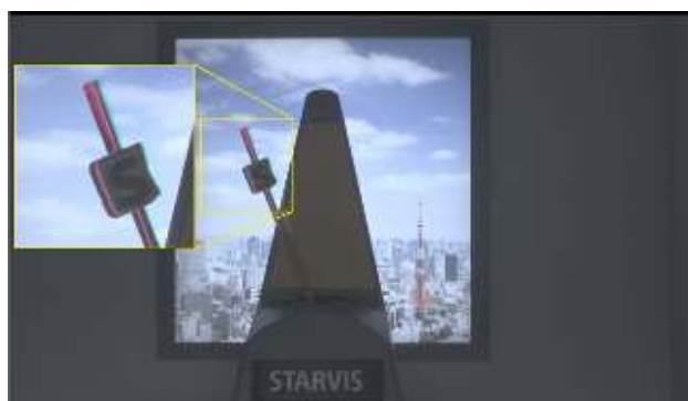
Conventional: DOL HDR