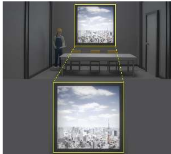
IMX662: One shot