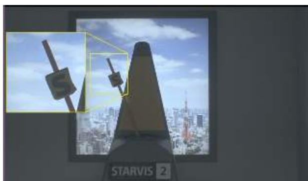
IMX662: Clear HDR